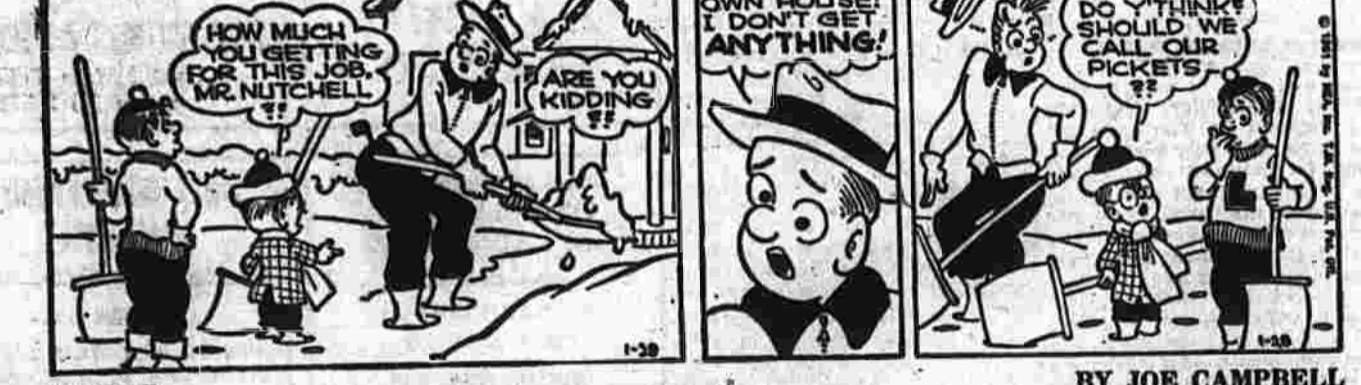
PRISCILLA'S POP BY JOE CAMPBELL