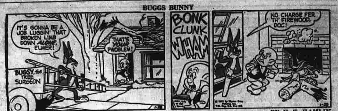
BUGS BUNNY BY V. T. HAMLIN