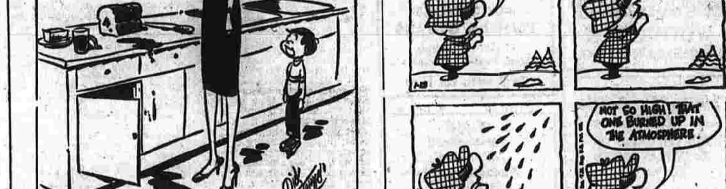
LITTLE SPORTS BY ROUSON