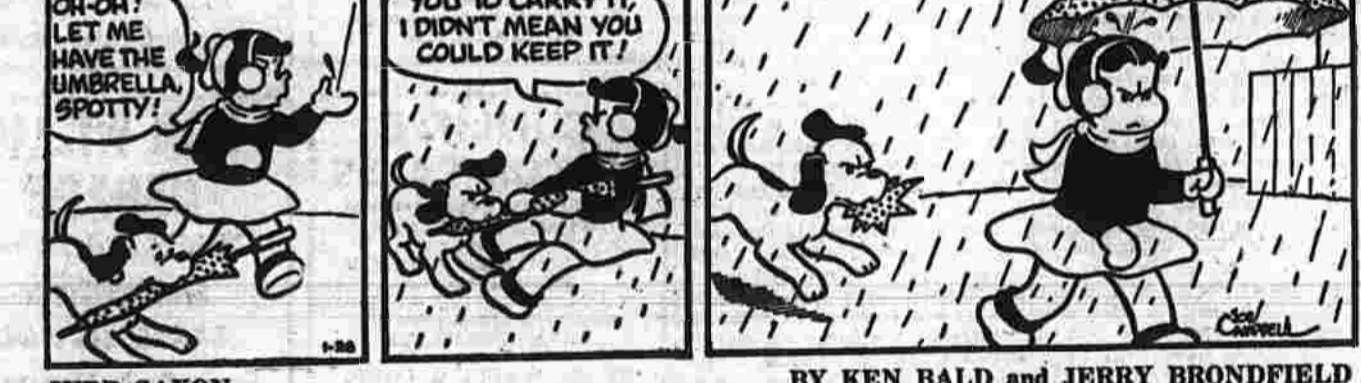
BONNIE BY JOE CAMPBELL