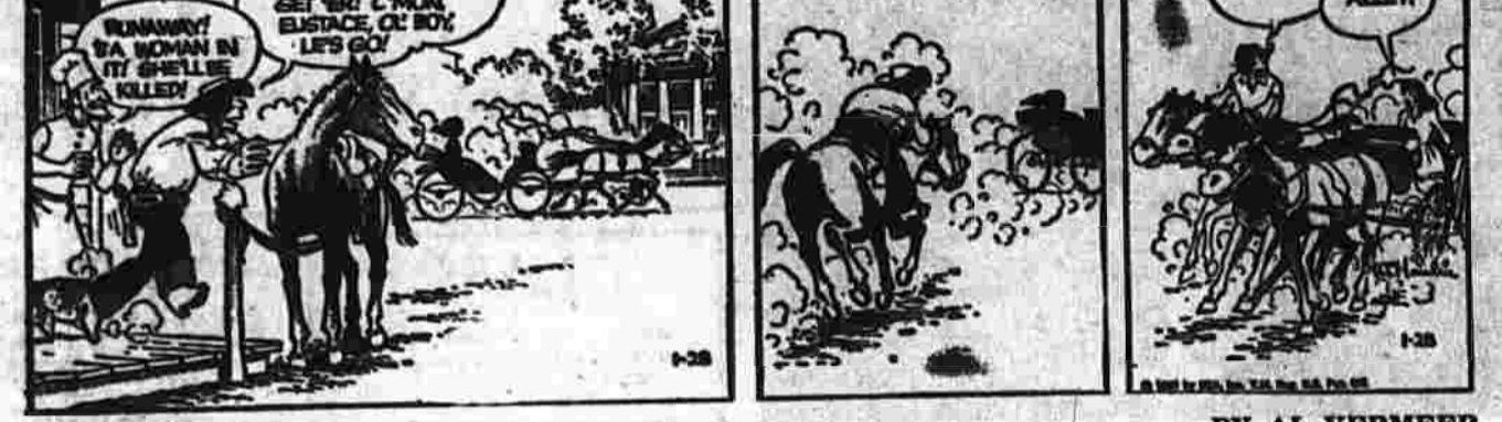
ALLY OOP BY AL VERMEER